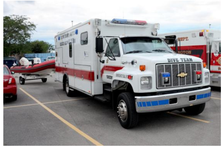
The Racine County (Div 102) Water Rescue Response Team was one of several called to the scene.