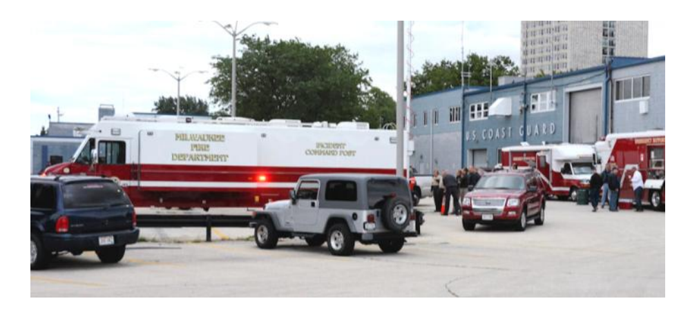
The Milwaukee Fire Dept Incident Command Post at the Coast Guard Staging location

Through this joint effort, the pilot and his passenger were recovered before darkness. Dive operations continued as it was not known if all four seats were in use. It was determined the next day that all victims were recovered.