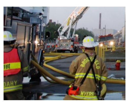
Some of the many Chiefs that assisted at the Patrick Cudahy fire