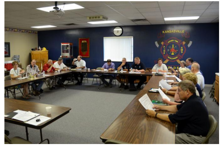
Rehab volunteers review the proposal

MABAS Wisconsin General Mailing Address PO Box 233