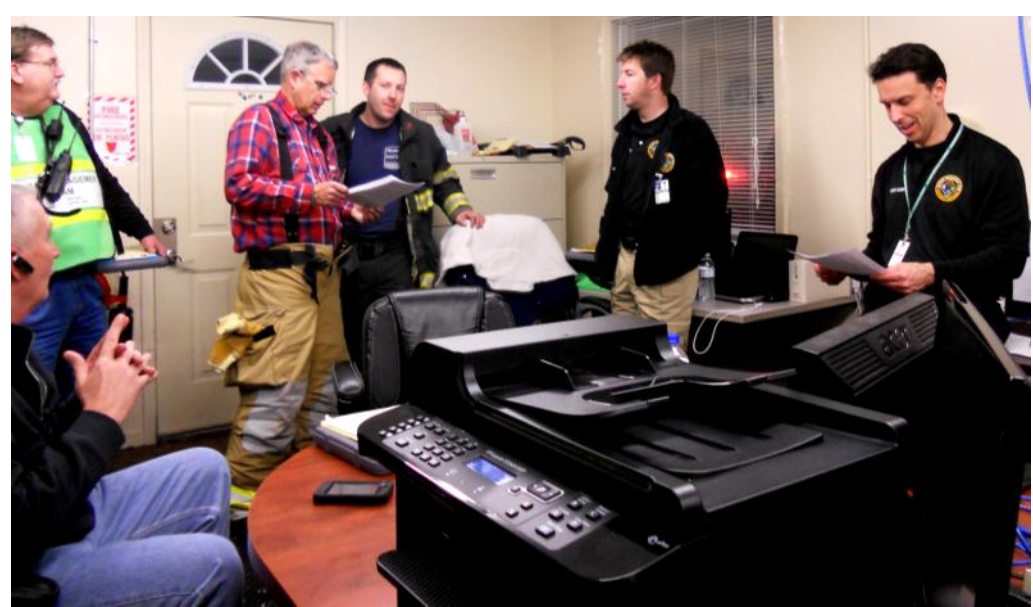
The SEW IMT assisting at Echo Lake Foods - see pages 10 & 12