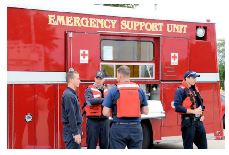
Divers from Divisions 109, 107, and 102 discuss the operation