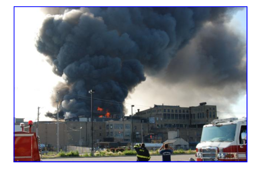
The view from the Patrick Cudahy staging area, about 16 hours into the fire

"If viewed by the public, a lack of confidence may negatively impact the public's perception of the competence of the fire department which could have a number of implications for the short term as well as for the long