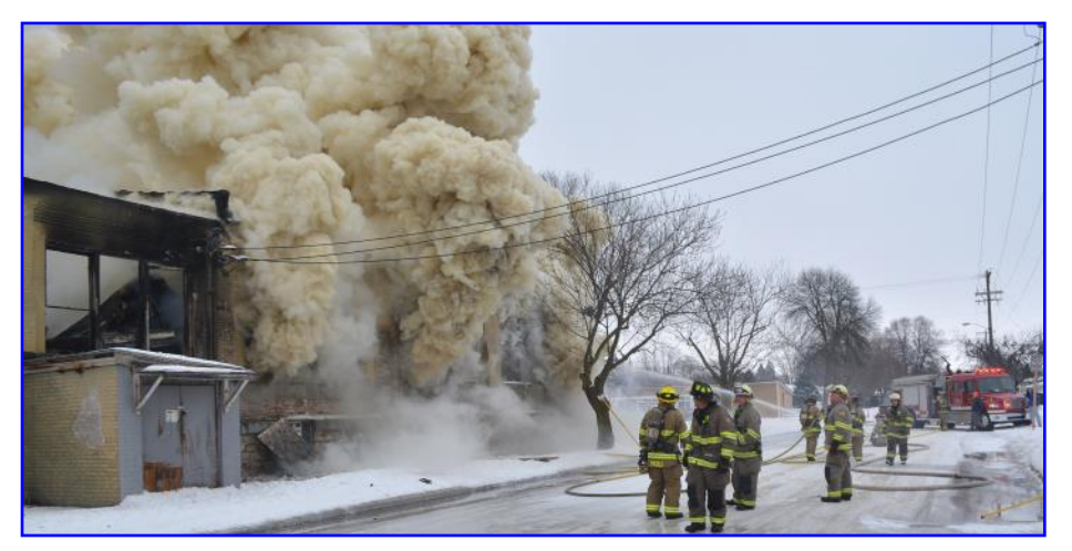
Above: C-D corner. Below: View of the D-side. (Photos by Val Ihde).

Officers and crews from the City of Menominee, City of Peshtigo, Town of Peshtigo, Menominee/Ingallston, Grover-Porterfield, and City of Crivitz Fire Departments worked very well together and reported only minor slips and falls due to ice conditions in some areas.