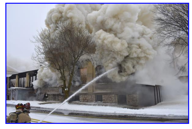
Left: Monitors in use. Right: Conditions shortly after arrival (Photos by Val Ihde).