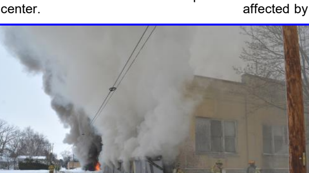
Above: Pole-to-Pole Fiber lines affected by the fire. Below: Command & Operations Chiefs discuss strategy.

As the fire progressed, city and county cable and fiber optic lines were knocked out by their close proximity to the fire. This hampered mobile data, computer and internet, and communications at the dispatch center.