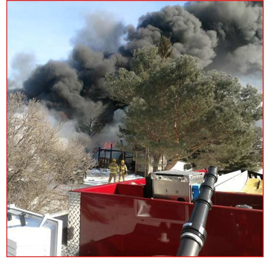
Shortly after Sugar Camp Engine 1 arrived on scene. First in crew advanced a 21/2" line to the B side of the structure.

To view past newsletters, visit: <u>www.mabaswisconsin.org</u> (look for the Newsletters links)