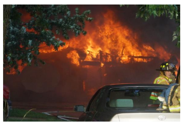
(Continued from page 1)

area. Fortunately, some personnel who were due to start work at 7:00 were available to respond and went to their jobs later.