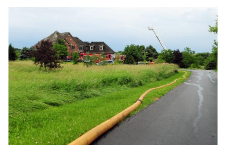
These photos and others are located at www.fyrpix.com in the "Featured Galleries Area"