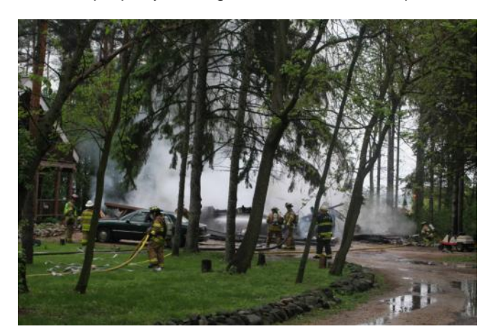
Above & Right: May 27, 2014 - The Dousman Fire District requested Waukesha County Div 106 Box 32-22 to a 2nd alarm level to prevent an adjoining structure from spreading to the house at 35000 Bartlett Road.

Often shown in this newsletter are pictures of the MABAS response to large structure fires. Equally valuable is the ability of MABAS to stop a fire from getting large and causing extensive property damage, as shown in these photos.