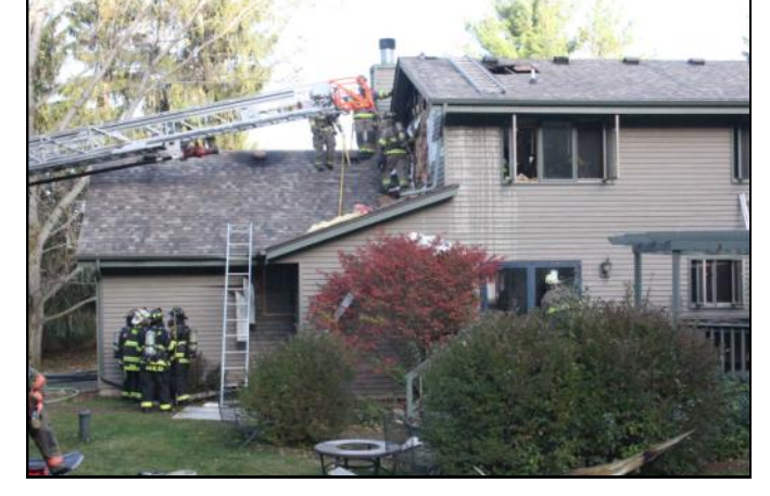
October 8, 2014 - Jarmon Road house fire responded by the Wales/Genesee Fire Department