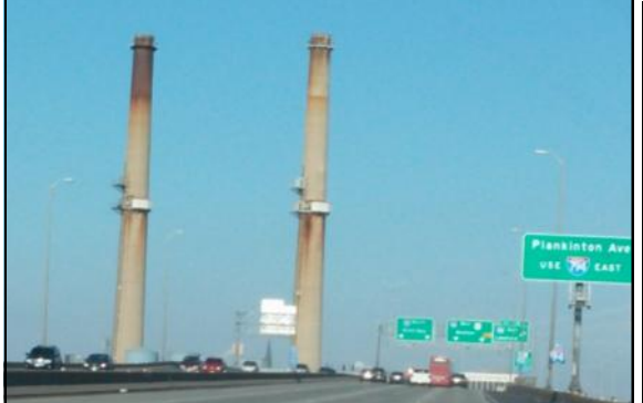
The smokestacks as seen from the I-43/I-94 "high-rise" bridge heading northbound into downtown Milwaukee.

The Valley Power Plant supplies power and steam heat to much of downtown Milwaukee. Its twin smokestacks are landmarks to the area as they tower over the interstate highway that runs next to it, which itself is known as the "high rise bridge" as it spans what was once Milwaukee's industrial valley with ramps exceeding the height of nearby 10-story buildings. Now, below it, Canal Street has an eclectic mix with the power plant bookended by the Potawatomi Casino 6 blocks to the west and the Harley Davidson Museum 4 blocks to the east.