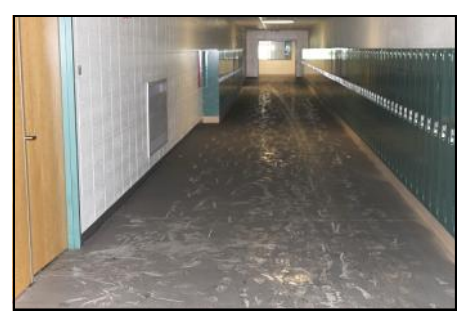
Figure 3: Long hallways meant long hose lays

Figure 3 gives a simple view of the long hose lays that were required to search these areas for the fire. The sheer size of the building was a special hazard on its own.