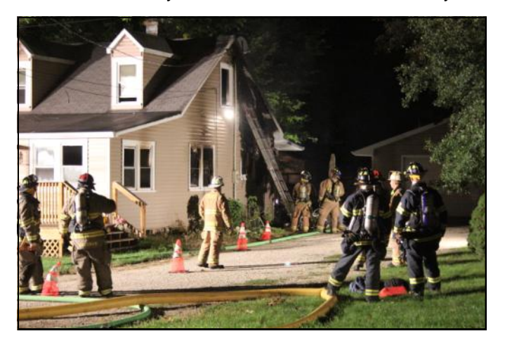
September 21, 2014 - Oak Street, Pewaukee

Waukesha County MABAS Division 106 had a flurry of MABAS boxes in September and October of 2014: