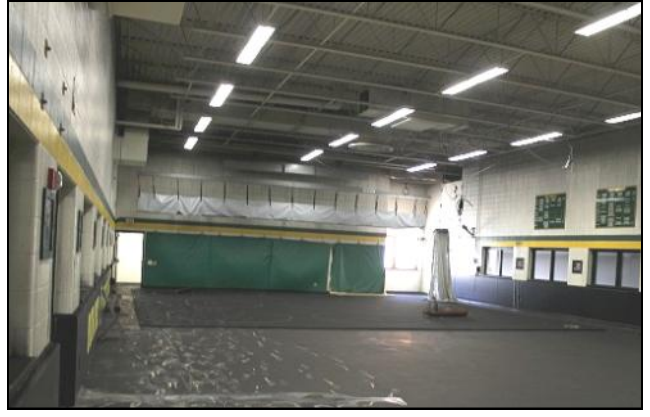
Figure 2: Second Floor Wrestling Room