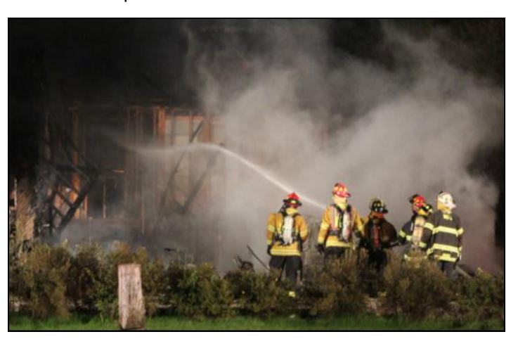
September 22, 2014 - Karin Drive in North Prairie