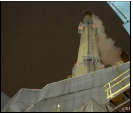
The smokestack the night of the rescue.